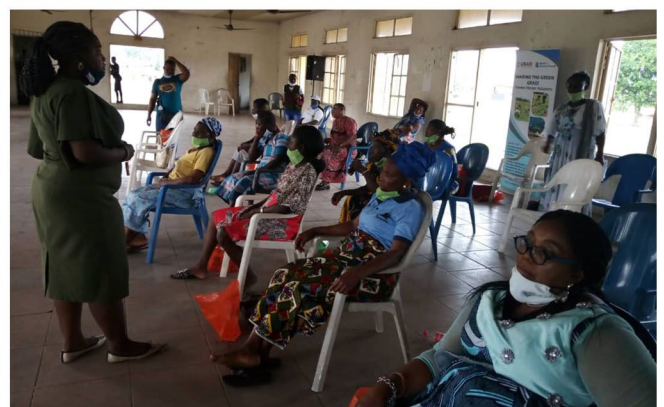
Photo from Ethiope East Women stepdown training

Project beneficiaries are the various farming and herder communities. These communities are represented in project implementation by; Community Chairmen, Presidents General, Community Development Committees, Community Vigilante Chairmen, Youth and women groups, Cattle breeder and owners. Other stakeholders include; Project Mediators, representatives All Farmers Association of Nigeria (AFAN) and Miyetti-Allah Cattle Breeders As-