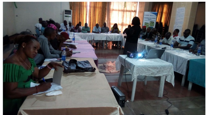
P2P collaborative training between farmers & herders

Project beneficiaries are the various farming and herder communities. These communities are represented in project implementation by; Community Chairmen, Presidents General, Community Development Committees, Community Vigilante Chairmen, Youth and women groups, Cattle breeder and owners. Other stakeholders include; Project Mediators, representatives All Farmers Association of Nigeria (AFAN) and Miyetti-Allah Cattle Breeders As-