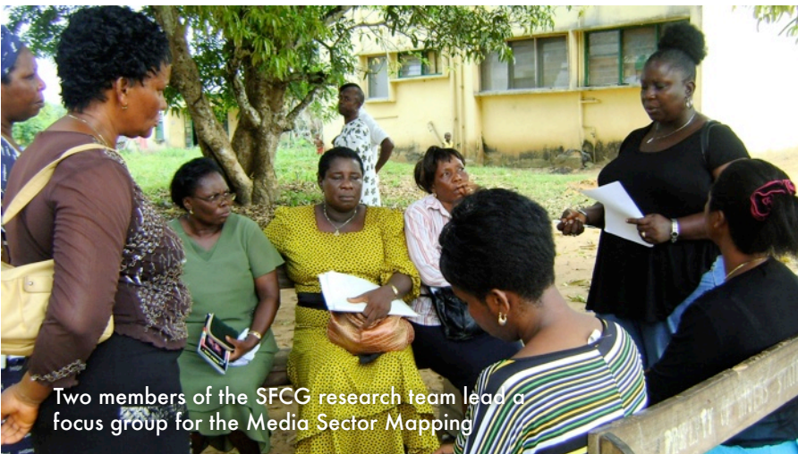
Two members of the SFCG research team lead a focus group for the Media Sector Mapping

In many countries, a gap exists between the government's communication intentions, goals and strategy and the information that actually reaches the people. Also, there are few feedback mechanisms in place that function as a way for citizens to ask questions and receive responses from the government at the local, state and national level. Formal and non-formal communication norms and traditions, as well as the specifics of different media are central to the successful management of conflict; however, without proper management and attention, communication can also be central to the creation, manipulation and maintenance of violent conflict. In Nigeria, state and national radio as well TV and print outlets represent underutilised resources to support and promote the country's development agenda and in addressing violent conflict, particularly in the Niger Delta and most recently, in Jos – central Nigeria.