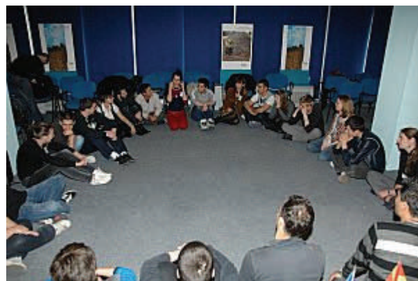
Youth participants in the Inaugural Conference