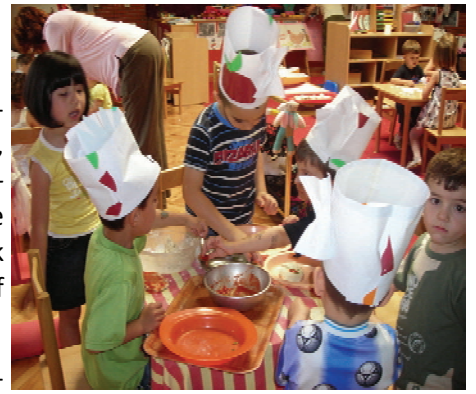
Children of the MOZAIK project

Reaching over 2000 beneficiaries, the Mozaik program socializes children from 3 to 6 years old, teaching them to be free from prejudices and stereotypes towards their diverse classmates, while also influencing their kindergarten staff, parents, family members, and local education authorities, thereby bringing a larger change in attitudes within the pre-school education system in Macedonia.