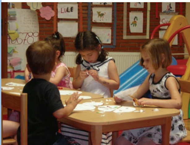
Kindergarten Children in Macedonia part of the MOZAIK Project