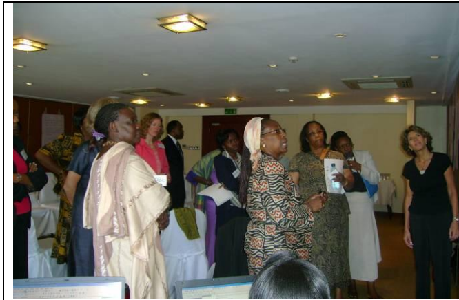
Below: Photographs from the consultative meetings