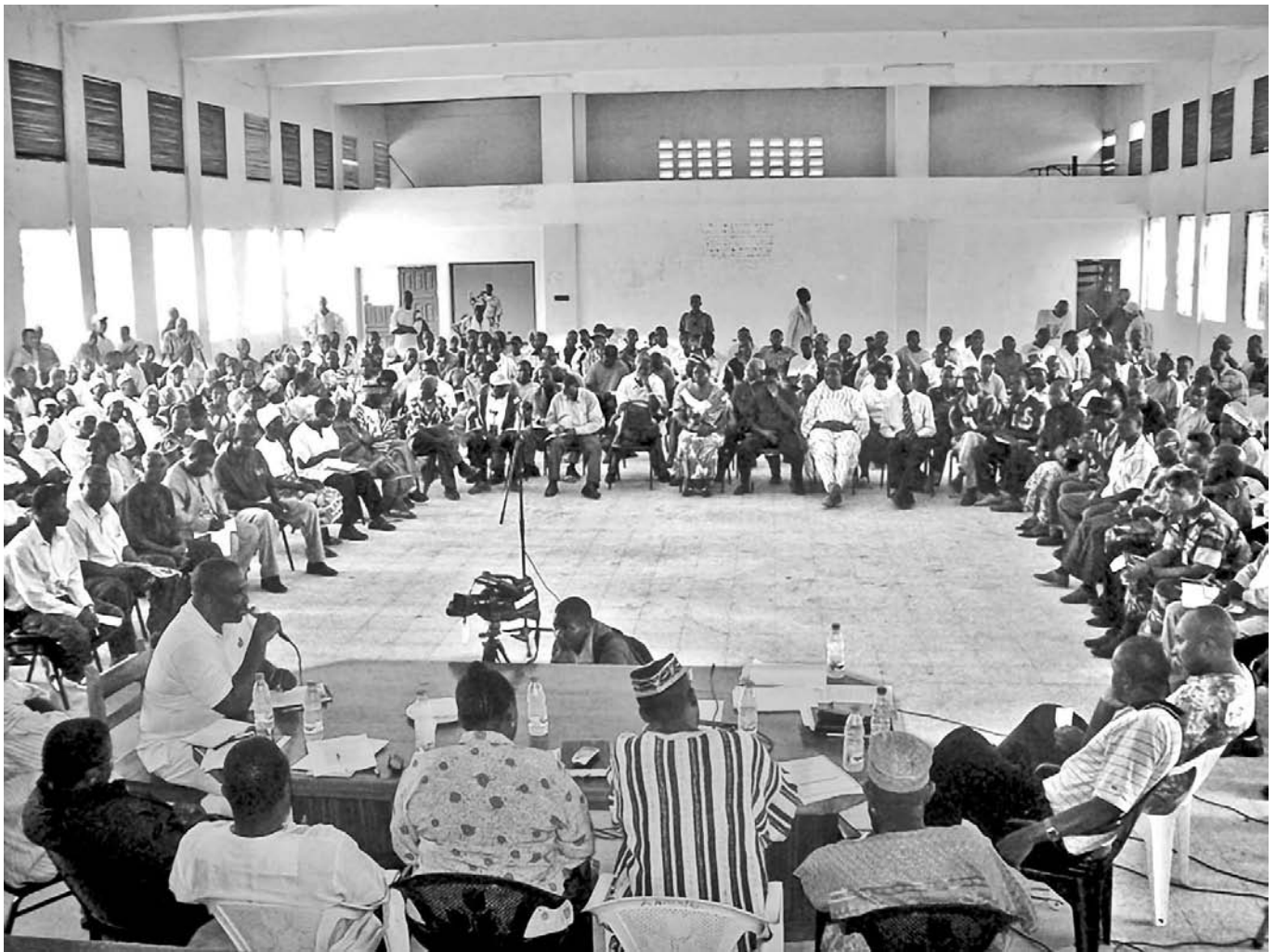
A town hall meeting with lawmakers, civil society, and citizens in Gbarnga, Liberia

In Liberia, SFCG produces a radio soap called Today is not Tomorrow (TNT). The Independent Newspaper's July 4th, 2007 edition referred to TNT as the best drama dealing with corruption in Liberia. The storyline depicts a negative character using his political connections and wealth to mismanage the community development funds. Through a community audit the report