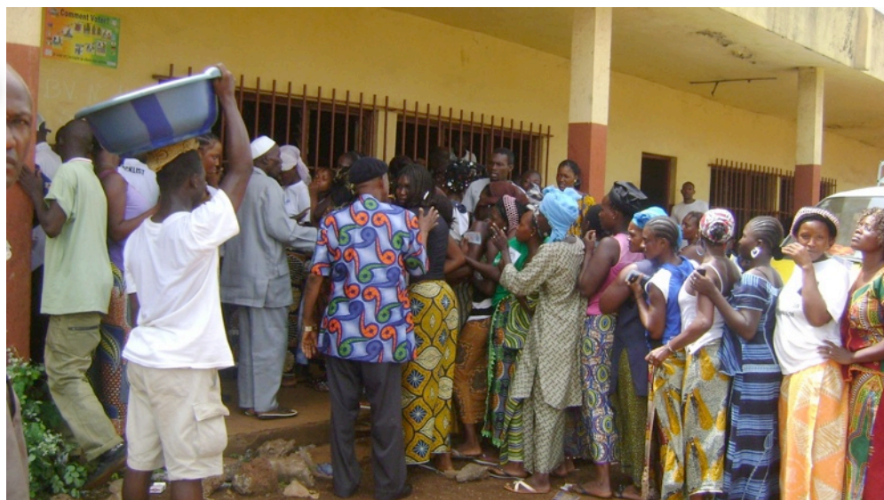
Guinean women line up to vote on election day

For the first time in its history, Guinea held a free and fair democratic election. Despite concerns about the rushed preparations and possible tensions, the elections conducted were overwhelmingly peaceful, with a very large voter turnout. According to figures released by CENI (the National Independent Electoral Commission), 80% of the four million Guinean voters went to the polls on Sunday to vote for a new President. Polling stations opened at 7am local time and stayed packed until 6:30pm or later. Women and youth played a large role in determining the election outcome, as large numbers of each participated. Polling stations also served as forums for gender dynamics to play out; at some polling stations, separate lines emerged for men and women, on the premise that women could return home more quickly, while at others, women insisted on waiting in the same because the voting procedure was the same for both genders. The presidential election of June 27, 2010 marks not only a major milestone in the long and courageous struggle of the people of Guinea for good governance, but even more significantly, a decisive moment in the march toward building a pluralistic democracy that expects accountability from its officials.